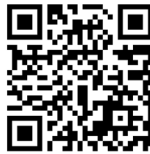
Complete a callback form